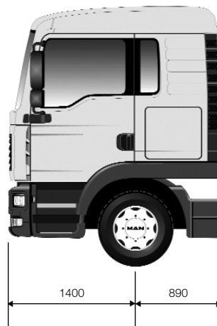
'L' Sleeper Additional Weight: 170 kg