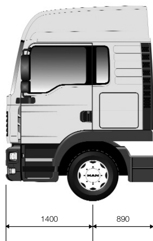
'LX' Sleeper Additional Weight: 235 kg

MAN Truck & Bus UK Ltd., Frankland Road, Blagrove, Swindon. Wiltshire SN5 8YU www.mantruckandbus.co.uk