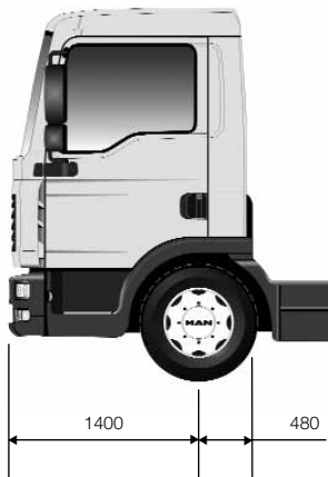
'C' Day Cab - Standard Additional weight: 0 kg

MAN Truck & Bus UK Ltd., Frankland Road, Blagrove, Swindon. Wiltshire SN5 8YU www.man-mn.co.uk