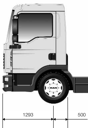
'C' Day Cab - Standard Additional weight: 0 kg

MAN Truck & Bus UK Ltd., Frankland Road, Blagrove, Swindon. Wiltshire SN5 8YU www.man-mn.co.uk